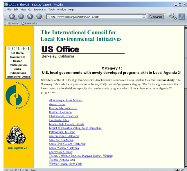
Image 2: The International Council for Local Environmental Initiatives — 1997 report

ICLEI, launched in 1990 at the World Congress of Local Governments for a Sustainable Future, is based in Toronto,